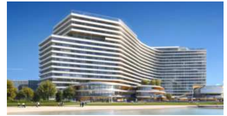
Hospitality & Tourism